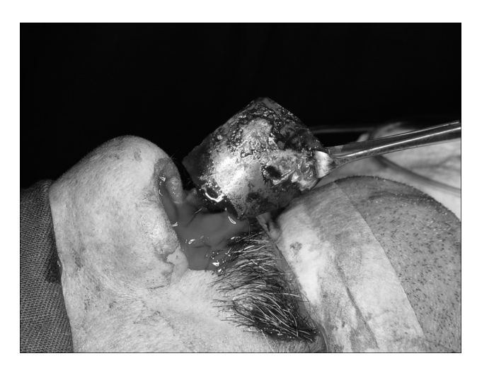
Figure 2 - Foreign body being removed by the nose. It was divided in three pieces.