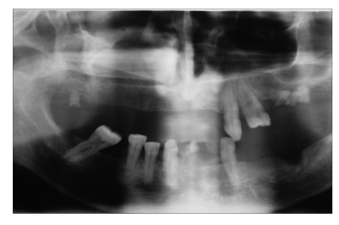
Figure 1 - Panoramic radiography showing a radiopacity superimposed at the right maxillary sinus.

Panoramic radiography exam showed a triangular radiopaque mass, superimposed on the right maxillary sinus and presence of the root of tooth 17, with a bucosinusal communication (fig. 1). During endonasal examination, we verified the presence of a foreign body, which extended into the nostril.